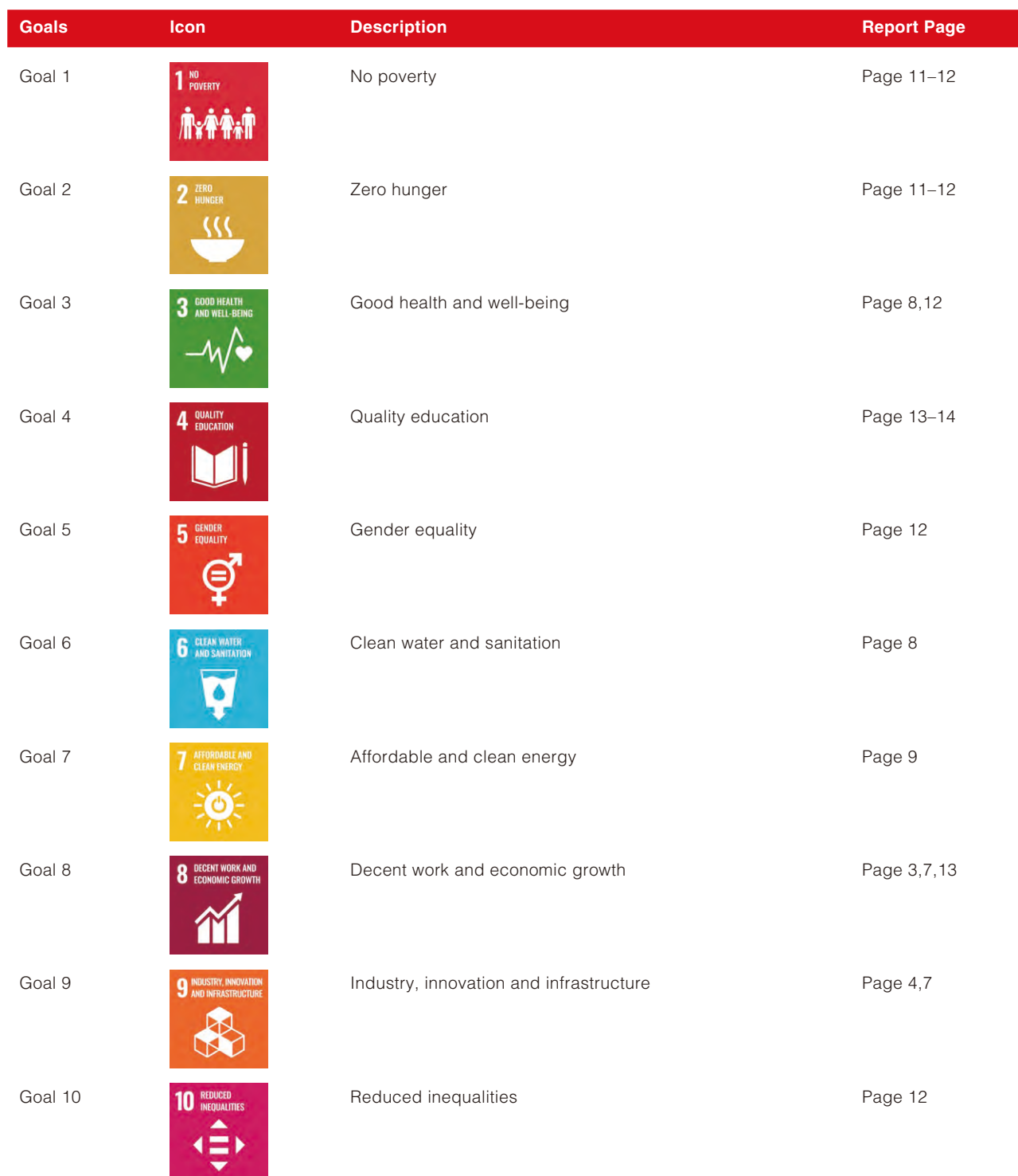
United Nations Sustainable Development Goals Reference Table